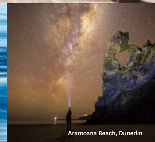
Aramoana Beach, Dunedin