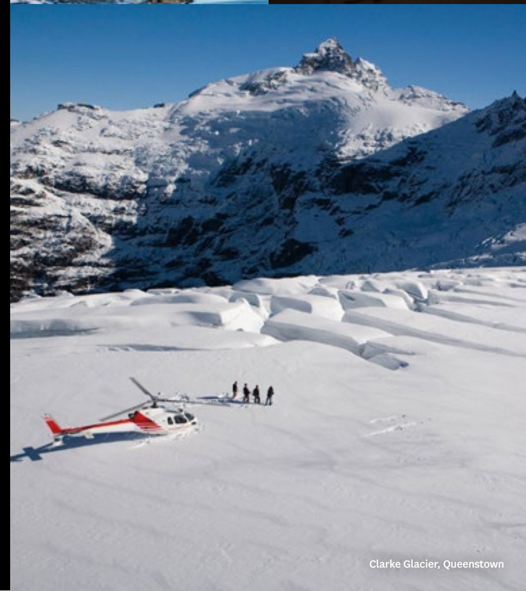
Clarke Glacier, Queenstown