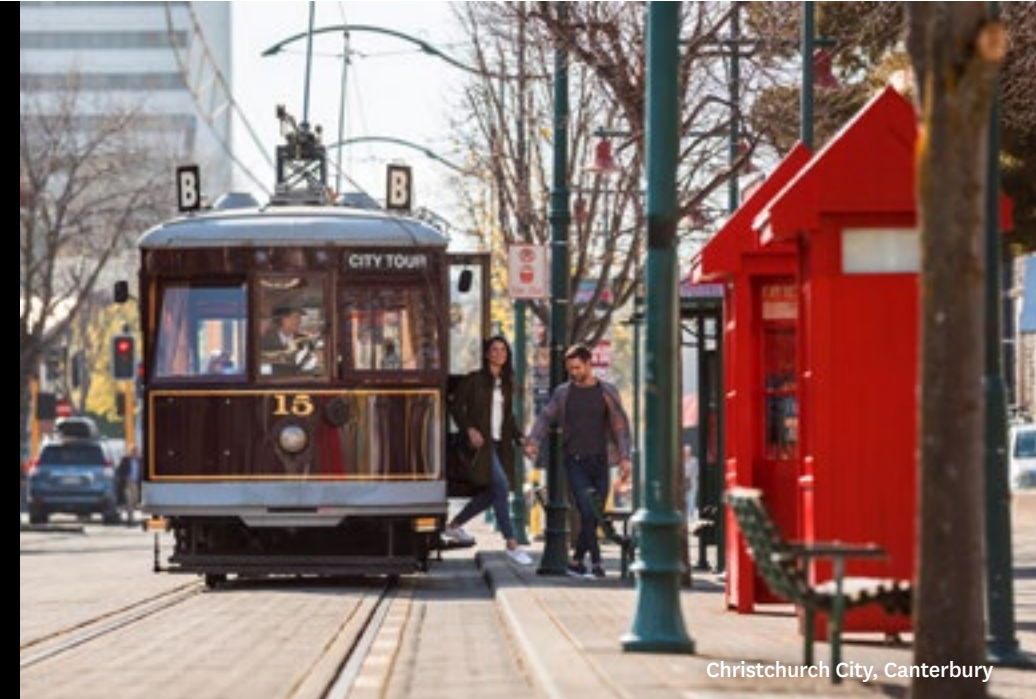
Christchurch City, Canterbury

Christchurch is a great gateway for any South Island adventure. Within easy range, choose from a coastal expedition north to Kaikoura's wildlife wonders, a breath-taking train journey across the Southern Alps or a lakeside sojourn in a dark sky reserve, perfect for stargazing. Let the adventure begin.